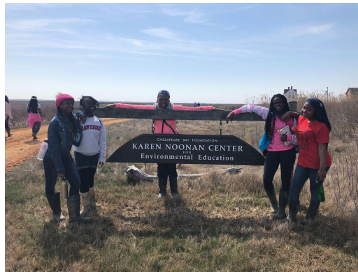
THE KAREN NOONAN CENTER